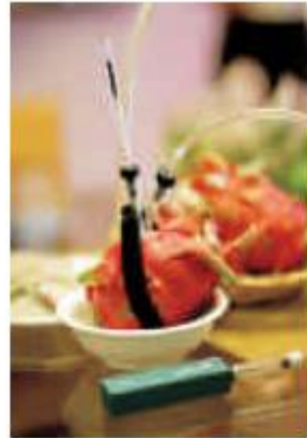
Collection of headspace samples from cooked foods and fruits